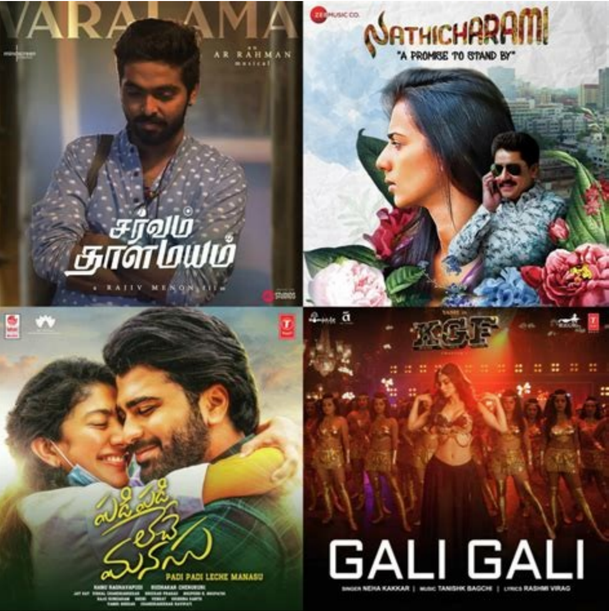
Milliblog Weeklies Week 52 | DEC16.2018